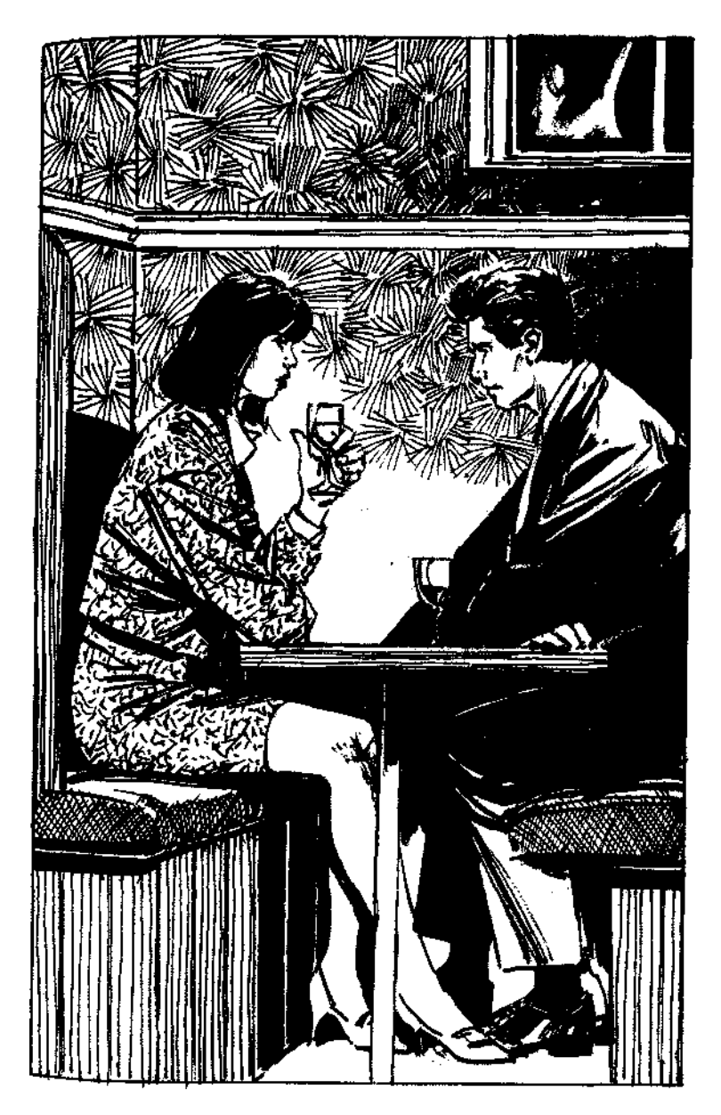
'This is unreal, Mitch. Do you expect me to live in a house where everything's bugged?'