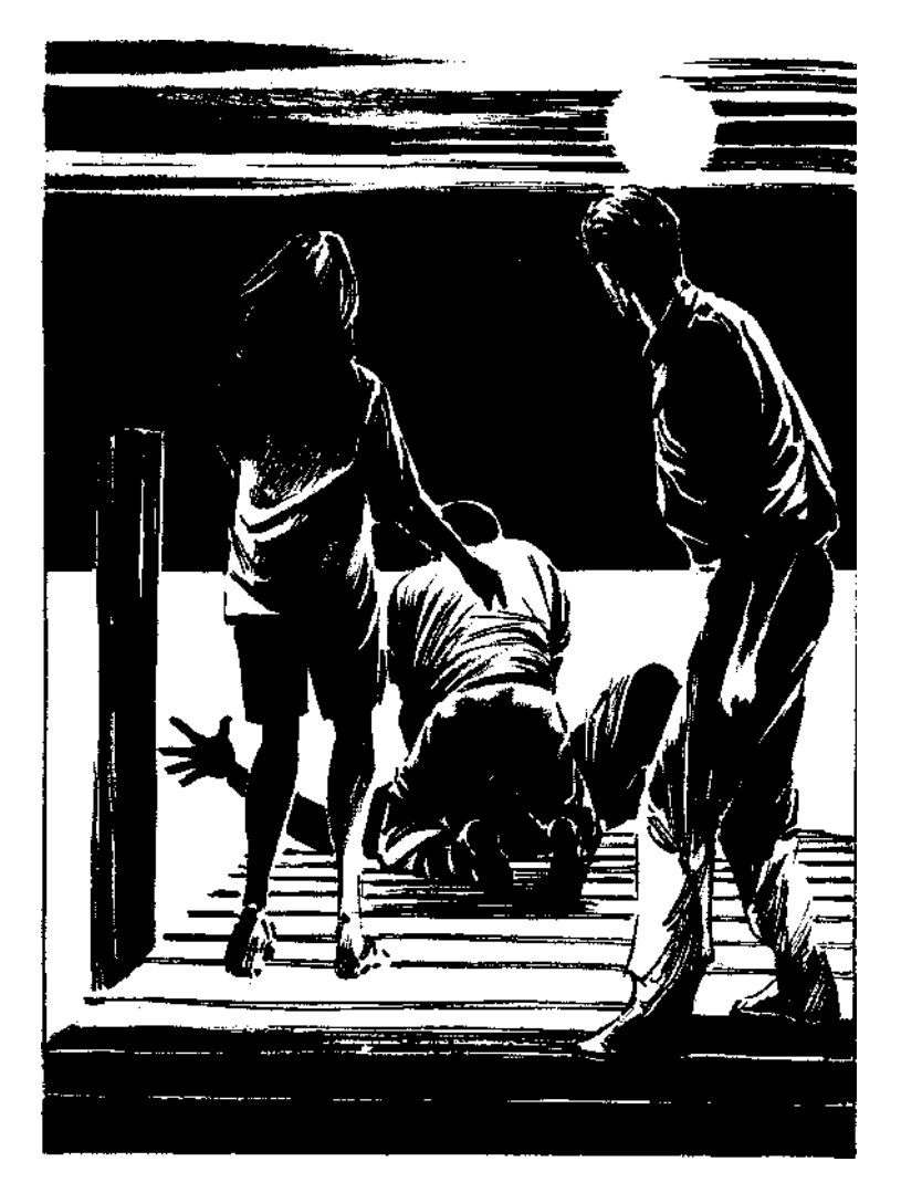
Ray twisted the rope around Rimmer's neck and tightened it. Rimmer didn't move.