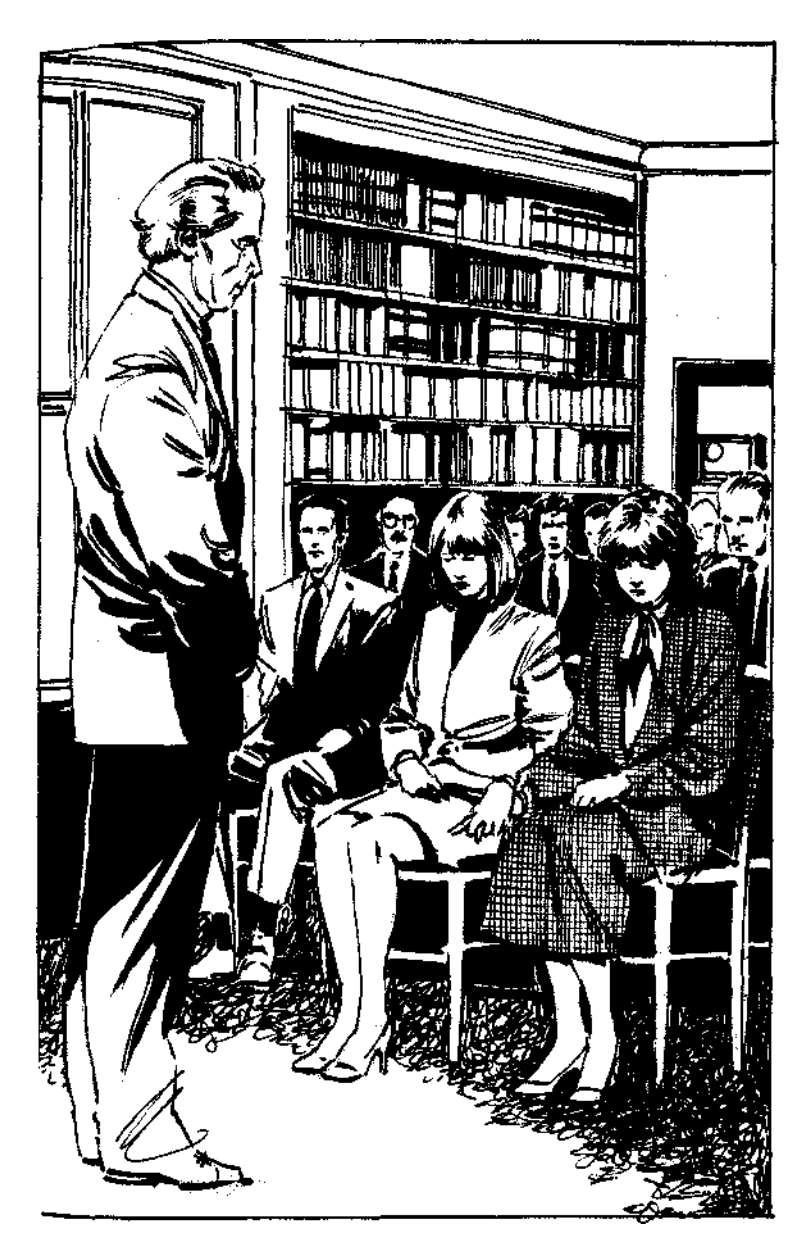
The widows held hands and cried softly.