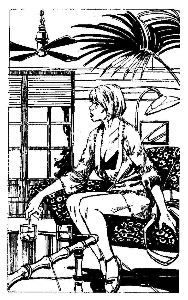
She took a small plastic packet from her bag and dropped some sleeping-powder into his drink.