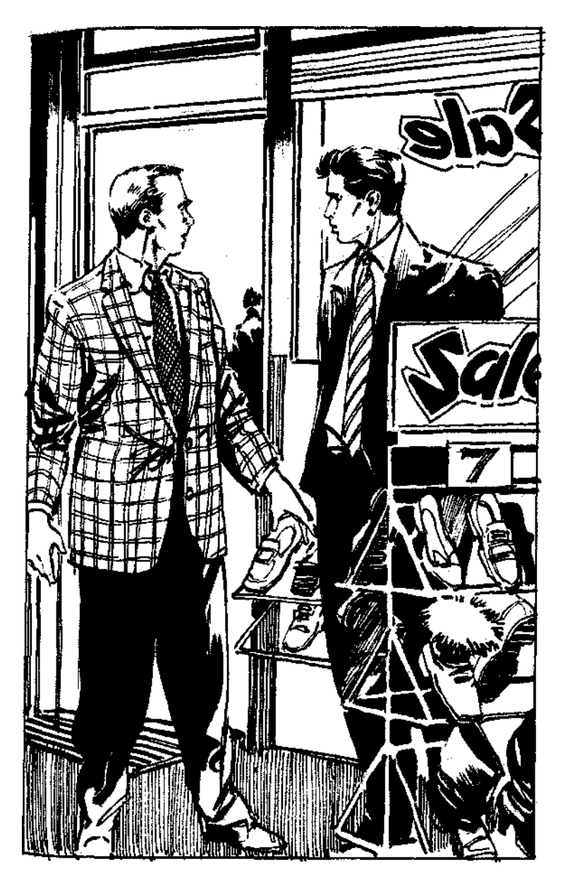
Tarrance started to say that it was time for Mitch to decide what to do, but he suddenly stopped.